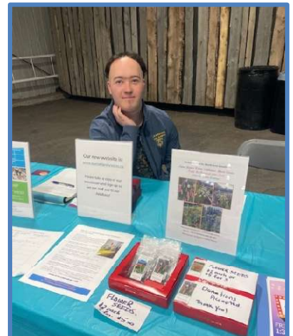
SFV promotions at local markets

In March we began hosting monthly coffee chats that have generated very interesting conversations. There has been much discussion around the changes being made to Assured Income for the Severely Handicapped (AISH) and the new Alberta Disabilities Assistance Program (ADAP) to be launched in July. We invite anyone interested in sharing and connecting to join us Monday, June 15 th at 7:00 pm at Olds Community Connection Centre.